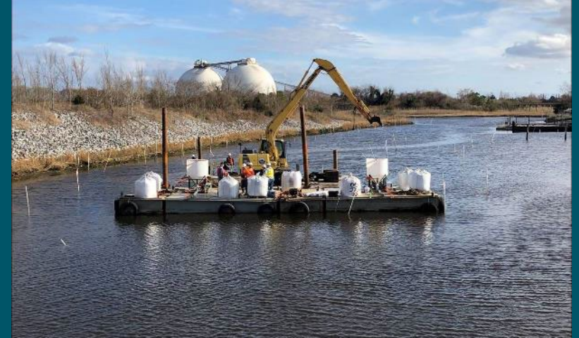
SediMite in situ placement, Paradise Creek