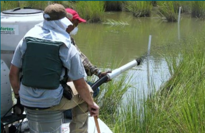
Mirror Lake, Delaware