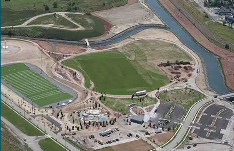
Sydney Tar Ponds, Canada