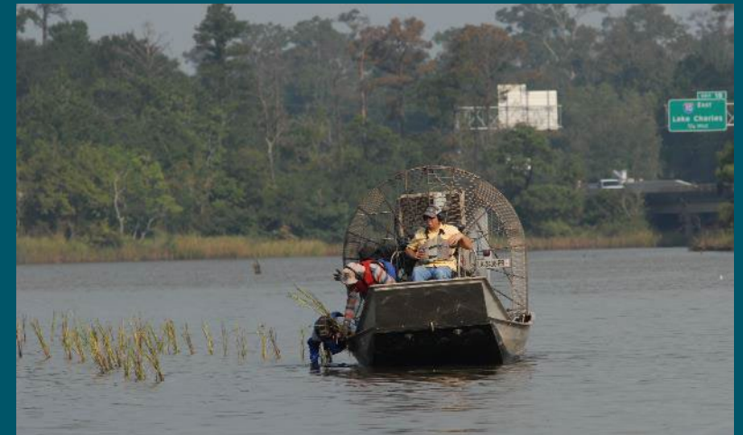
Gulf Coast Site, Wetland Development