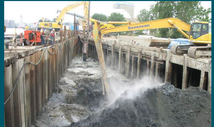
Island End River