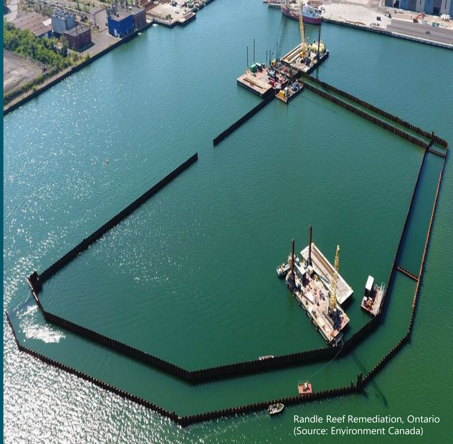
Randle Reef Remediation, Ontario