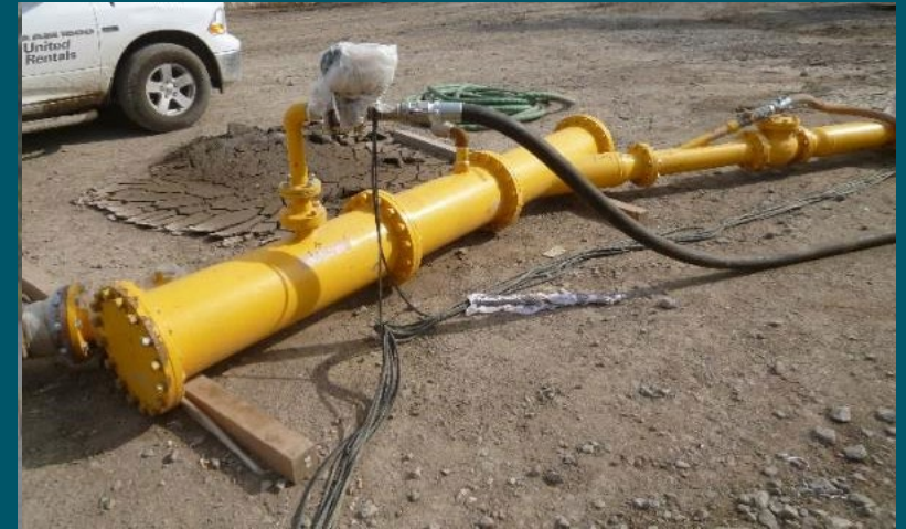
Pneumatic Flow Tube Mixing (Tipping Point/Eric Stern)