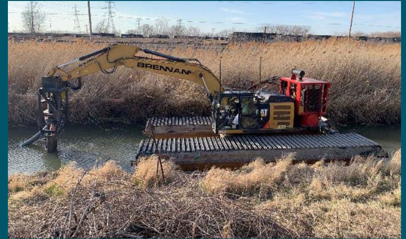
Ninigret Pond mechanical excavator (J.F. Brennan)

If you specify what should be accomplished (in terms of performance metrics), a contractor can usually build it, given sufficient lead time