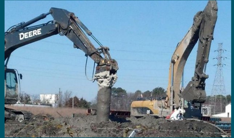
Atlantic Wood Industries